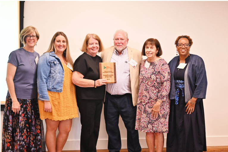
Carl W. Vierling Groundbreaker Award SENIOR RESOURCES OF GUILFORD